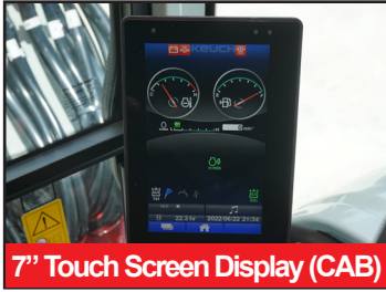
7" Touch Screen Display (CAB)