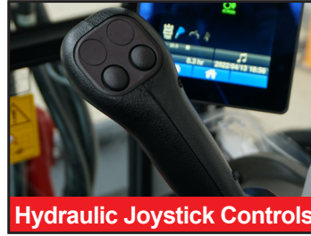
Hydraulic Joystick Controls