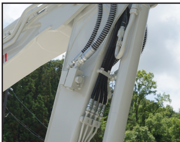
Up to 4 Service Ports (Optional)