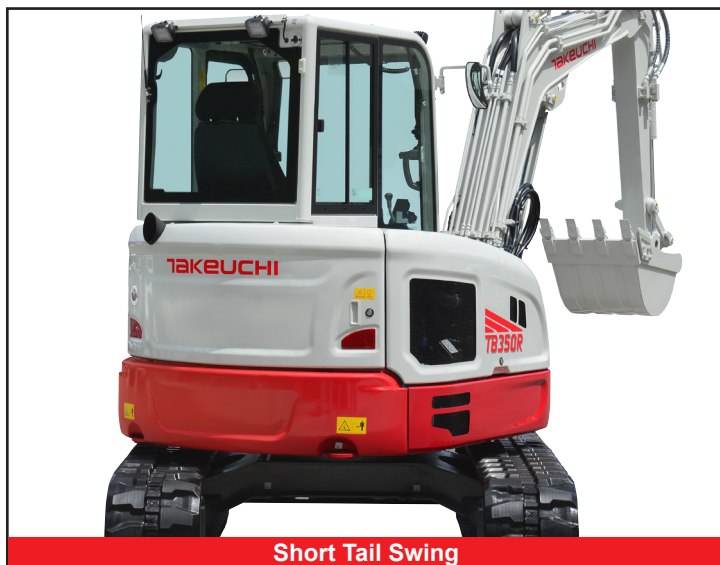
Short Tail Swing

*Functions may not be available in all countries, so please consult your Takeuchi dealer for details.