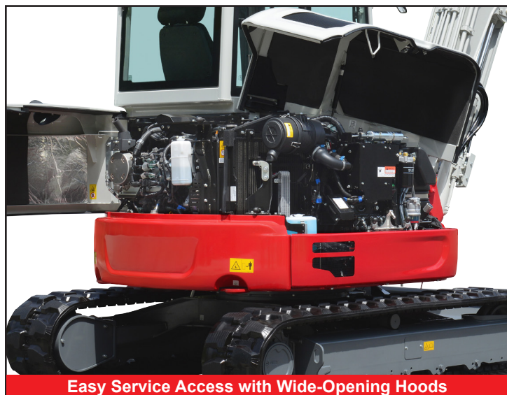
Easy Service Access with Wide-Opening Hoods