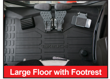
Large Floor with Footrest

Takeuchi's TB350R, TB300 Series, compact excavator features the latest technology and a short tail swing design that makes it ideal for working in tight or confined spaces. Inside the cab, a seven-inch, multifunction color monitor with touch screen places a wide range of functions at the operator's fingertips. A dedicated coupler circuit allows for the quick and easy exchange of various hydraulically driven attachments when used with an optional hydraulic coupler. A jog dial with one-touch controls lets operators easily control throttle position and multiple machine functions. The TB350R also offers a dig depth of 3,575 mm, maximum reach of 6,065 mm and maximum dump height of 3,945 mm. Combine those working ranges with its high-flow primary auxiliary circuit, and the TB350R is ideal for multiple applications, including demolition, land/vegetation management, general contracting, landscaping, hardscaping, rental, residential, and commercial construction.