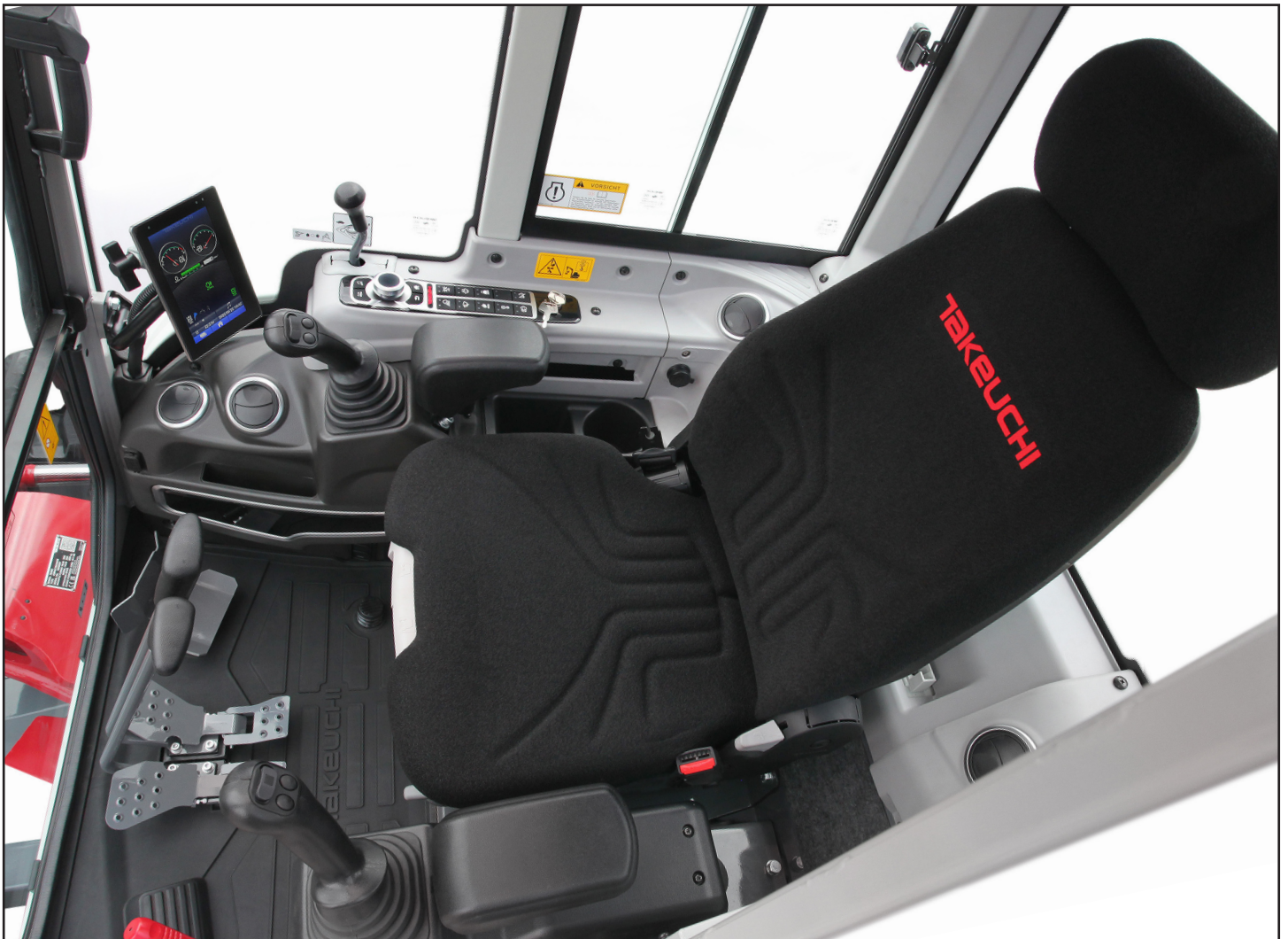
Completely Redesigned Automotive Styled Interior with Intuitive Operator Controls

Takeuchi's TB350R, TB300 Series, compact excavator features the latest technology and a short tail swing design that makes it ideal for working in tight or confined spaces. Inside the cab, a seven-inch, multifunction color monitor with touch screen places a wide range of functions at the operator's fingertips. A dedicated coupler circuit allows for the quick and easy exchange of various hydraulically driven attachments when used with an optional hydraulic coupler. A jog dial with one-touch controls lets operators easily control throttle position and multiple machine functions. The TB350R also offers a dig depth of 3,575 mm, maximum reach of 6,065 mm and maximum dump height of 3,945 mm. Combine those working ranges with its high-flow primary auxiliary circuit, and the TB350R is ideal for multiple applications, including demolition, land/vegetation management, general contracting, landscaping, hardscaping, rental, residential, and commercial construction.