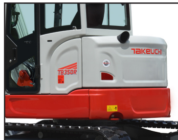
All Steel Construction